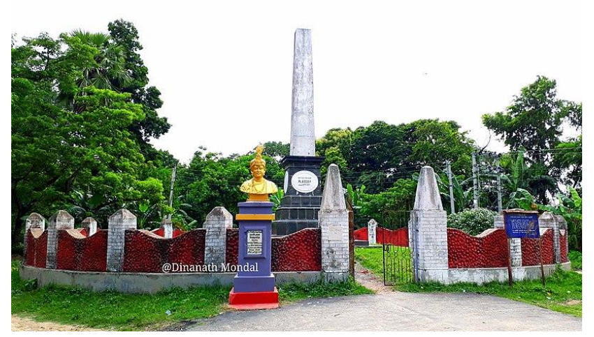
Plassey Monument, Nadia district, West Bengal, India.