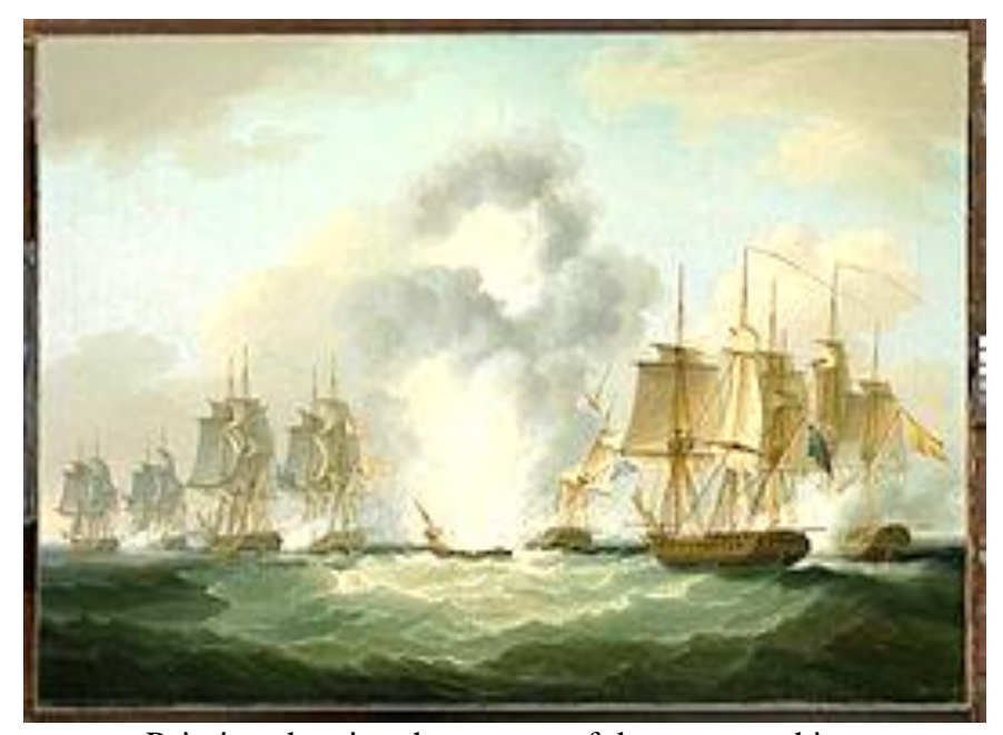
Painting showing the capture of the treasure ships.

When this coin was minted in 1804, the British made a surprise attack without declaring war. The British navy attacked a Spanish squadron of Frigates that was carrying gold and silver bullion to Cadiz. The Spanish Flagship blew up and the British captured the rest. The capture of this treasure and the 1805 Battle of Trafalgar between the Spanish and French Fleets against the English Fleet put a stop to any thought of a French invasion of England.