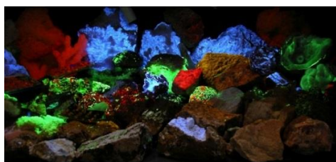
Minerals under short wave UV