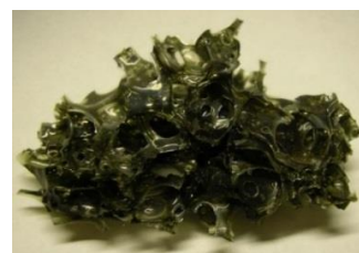
Atom Bomb glass