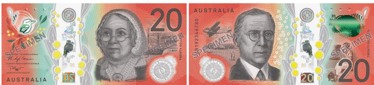
The new Next-Gen $20 released on 9 October 2019.