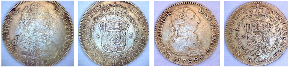
d) SPAIN. Bolivia. Charles III. 1785AD Gold Eight Escudos. Potosi Mint. 36mm, 27.07 grams & .904 gold. e) SPAIN. Charles III. 1788AD Gold Two Escudos. Madrid mint. 22mm, 6.76g, .875 gold.