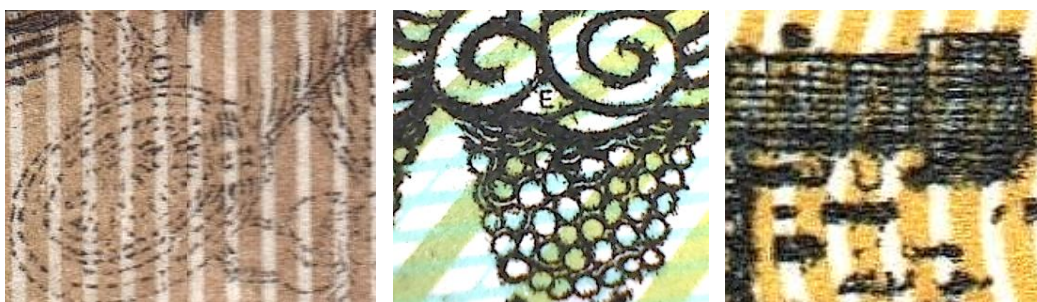
Newly discovered earlier PIL positions $1, $2 and $10.

Mick discussed and showed examples of PILs found in Australian banknotes: