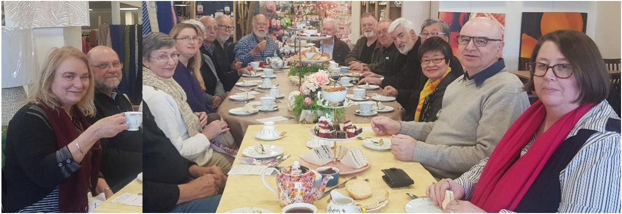
The outing on Monday afternoon for high tea at the Wohlers Richmond store, July 2019.

With a rainy morning the skies cleared and a total of 18 including a few whose GPS must have sent them elsewhere arrived to be greeted by Wohlers' friendly staff.