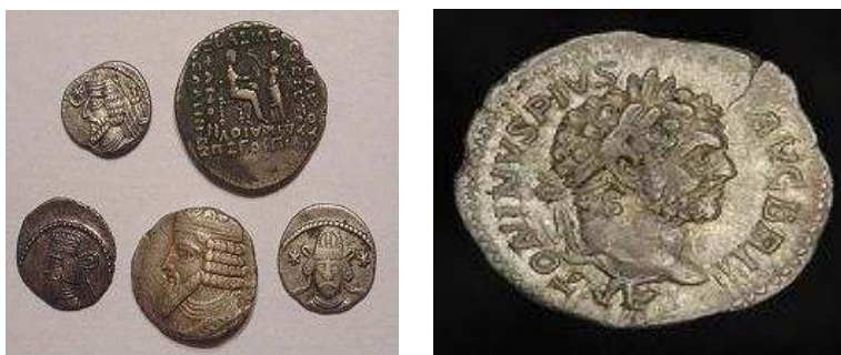
Parthian coins. Emperor Caracalla 1 Denarius, VF.