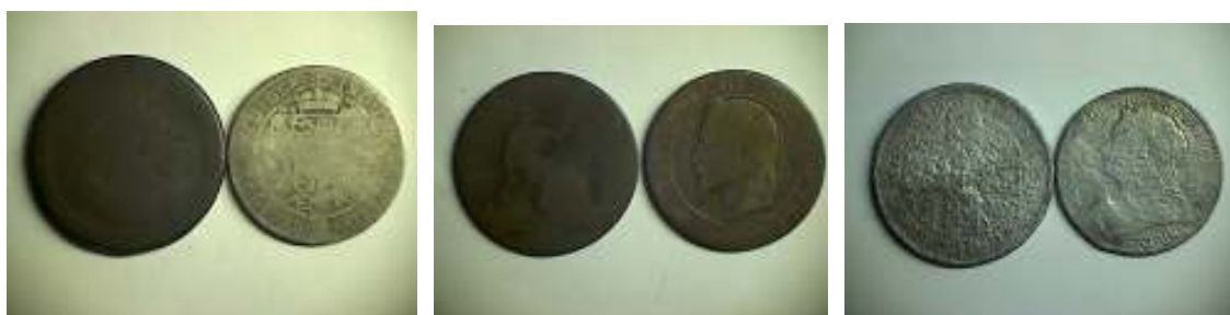
Illustrated left to right, 1797 penny, 1800s half crown, halfpenny, French copper coin and a "godless florin" and florin found by metal detector in the sea at Wallaroo.