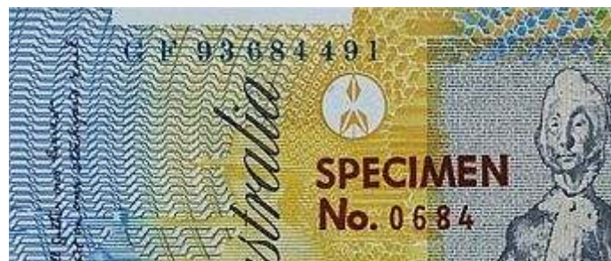
Rare specimen, or a mockup? – see page 9.